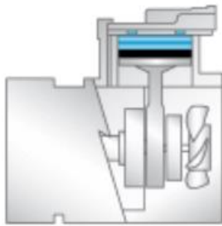
Large Single Piston Design

This air compressor comes complete with battery clamps and cord that allows you to attach the air compressor to a standard car battery for power.